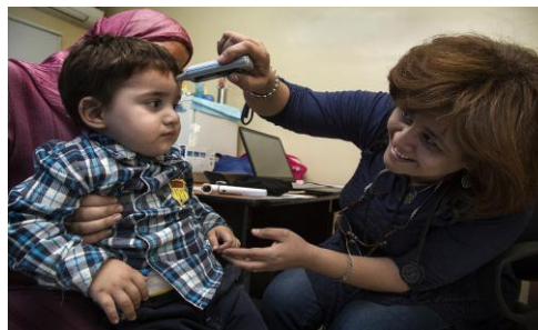
Primary and specialized health care provision through a variety of primary care clinics and specialized referral hospitals. Egypt - Cairo, S.Nelson/UNHCR

Participating Agencies: UNHCR, WHO, UNICEF, UNFPA, Arab Medical Union (AMU), Caritas, Ministry of Health, Mahmoud Mosque Society, Refugee Egypt, IOM, Save the Children