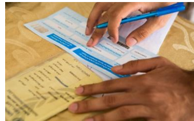
WFP paper food vouchers, Photo/ WFP