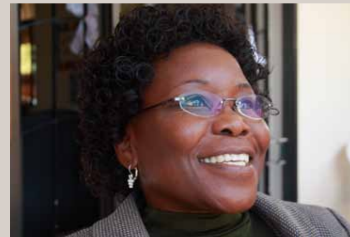
"Persons with albinism are just ordinary people"

When first rumours then credible reports of albinos being murdered for body parts began two years ago, Ntetema felt it was her duty as a journalist to investigate.