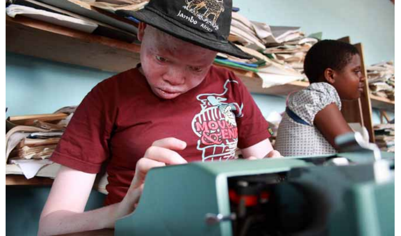
A teenage albino girl practises typing at the Mitindo school.

this total includes only people who come forward voluntarily to register. Now, after the killing spree, this most conspicuous group of people are doing everything they possibly can to make themselves inconspicuous.