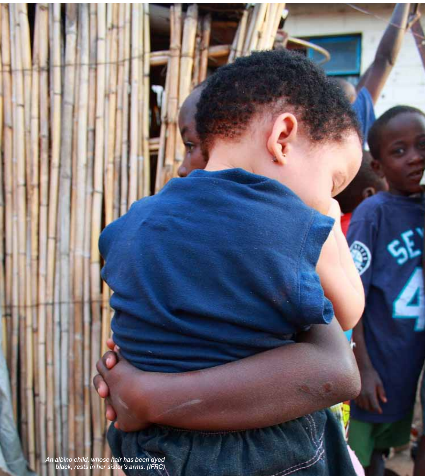
An albino child, whose hair has been dyed black, rests in her sister's arms.

The first step in the response to the aftermath of the killings, as with any humanitarian intervention, is to register the beneficiaries. But in this “silent emergency” they must first be found. In the current atmosphere of mortal danger, albinos in remote rural areas (still the vast majority) are only likely to reveal themselves to community-based Red Cross volunteers.