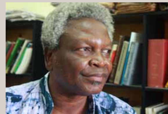
“The purpose was to help albinos mobilize”