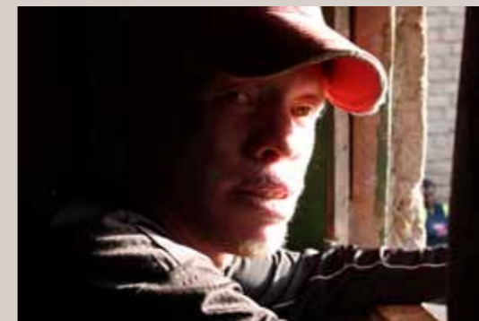
“If you don’t go out in the sun, you don’t eat”