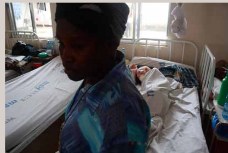
“He’s been saying his goodbyes”