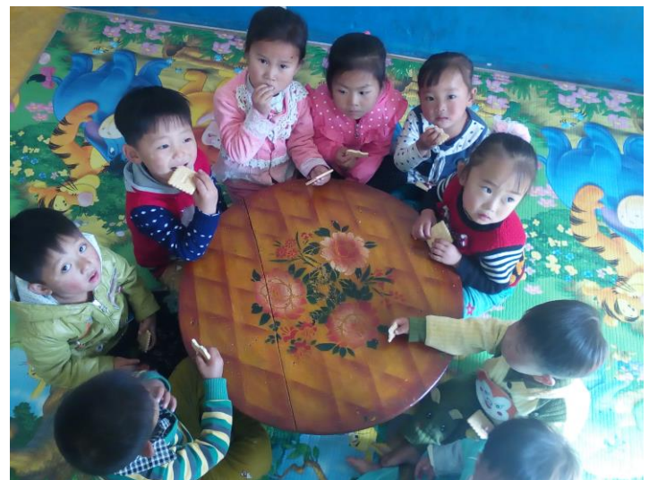
Caption: Children receive fortified biscuits in a nursery located in North Hamgyong province. WFP's fortified foods contain important micronutrients, fats and proteins vital for cognitive and physical development.

WFP's operation contributes to the Sustainable Development Goal (SDG) 2 -Zero Hunger, SDG 17 - partnerships and to the outcomes of the United Nations Strategic Framework for DPR Korea (2017-2021). The needs identified in the PRRO are reflected in the Needs and Priorities document as presented by the Humanitarian Country Team in DPR Korea.