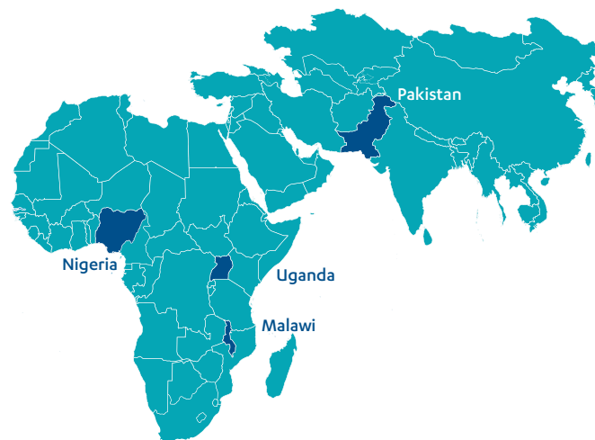
Figure 1: Map of country case study locations

2.2 The methodology provided a good level of triangulated data to explore the relevance and effectiveness of DFID's approach to value for money. Both the methodology and this report were independently peer reviewed.