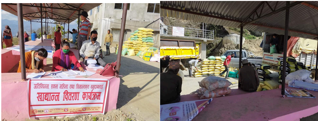
Distribution in Dailekh District