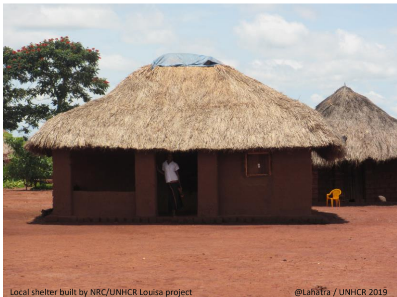
Local shelter built by NRC/UNHCR Louisa project