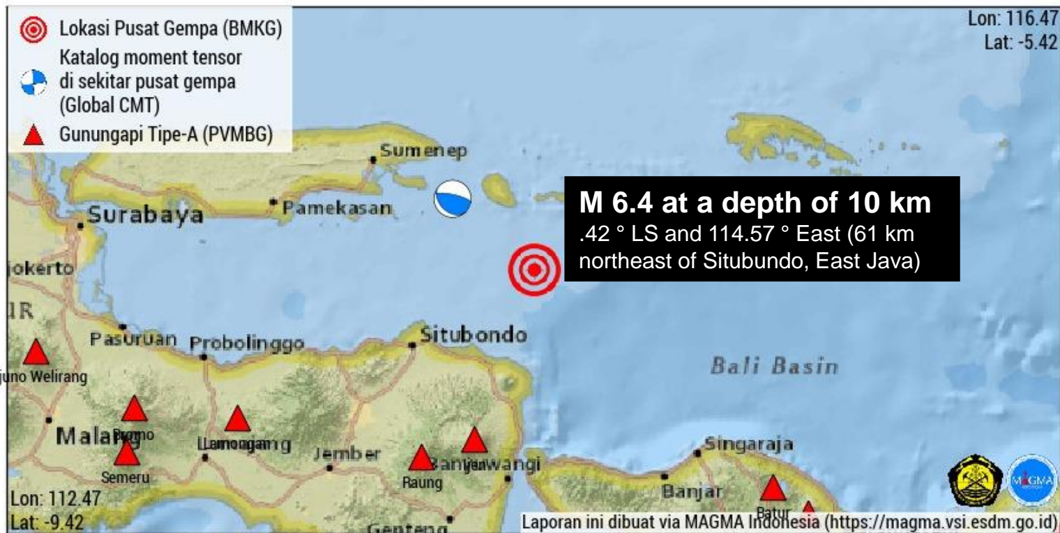
Laporan ini dibuat via MAGMA Indonesia ( https://magma.vsi.esdm.go.id )

MAG: 6.4 SR; KOORD: 7.42 LS 114.47 BT; KDLMN: 10.0 KM; GUNUNGAPI TERDEKAT: IJEN (75.25 KM)