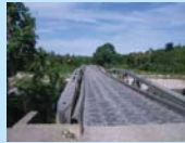
One way bridge

Jeremie to Abricot- Poor condition, road surface is a mix of dirt and rock. Sharp curves, steep slopes, one way in parts and probability of landslides after rains