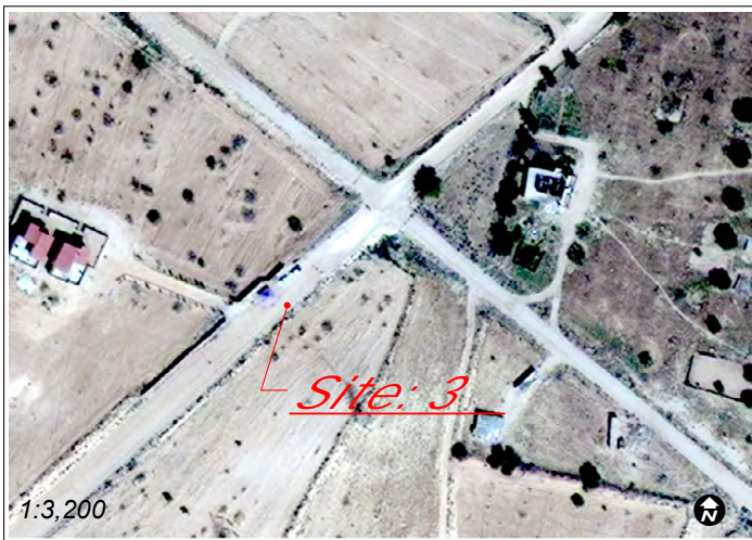
WorldView-02 satellite image recorded 14 March 2011