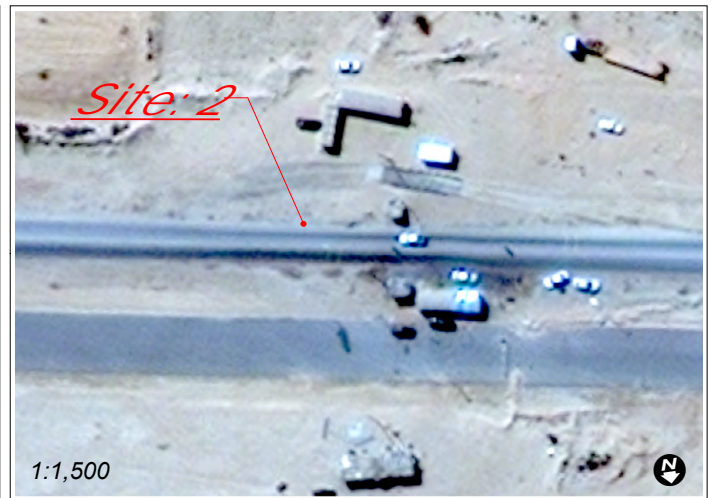
WorldView-02 satellite image recorded 14 March 2011