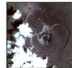
Crater and clouds