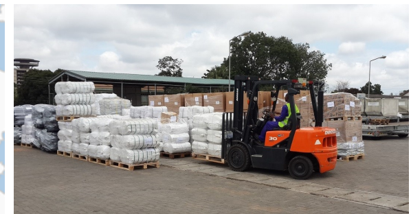
Blankets, tents, water tanks, nets and other supplies from Irish Aid were recently dispatched from UNHRD Accra and chartered to Sierra Leone.

UNHRD continues to support Ebola response efforts of WHO, JICA, Irish Aid, UNHCR and WFP. Since March 2014, UNHRD depots in Dubai (UAE) and Accra (Ghana), Las Palmas (Spain) and Brindisi (Italy) have dispatched US$ 3.9 million worth of protective gear, emergency health kits, relief items and support equipment to the region. Weekly dispatches are ongoing.