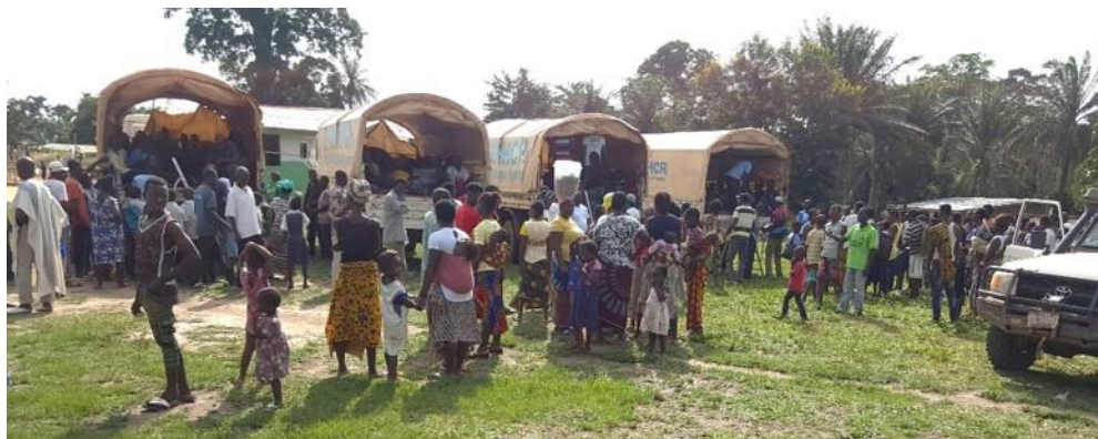
Ivorian refugees in PTP Settlement get on the convoys to return to Cote d'Ivoire.