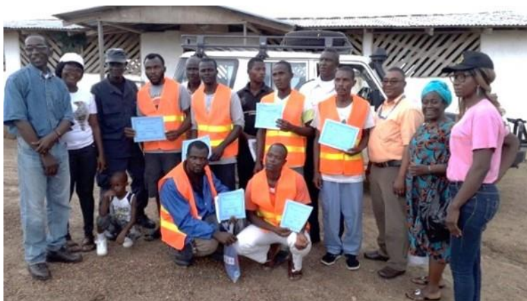
Participants of the Community Watch Teams training showing their certificates.