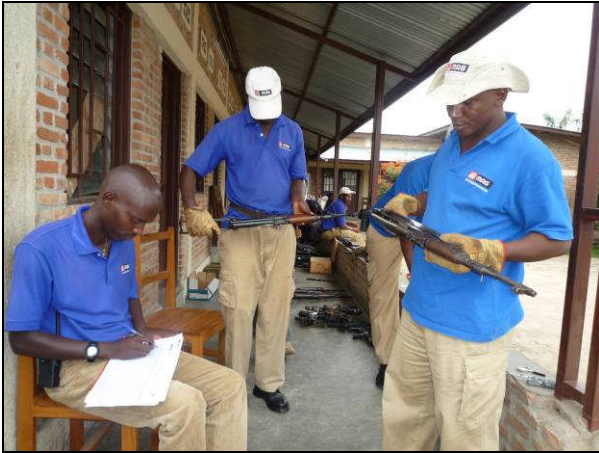
The MAG-PNB mobile team registers weapons handed-over to the CDCPA during the civilian disarmament campaign, Bujumbura Mairie.