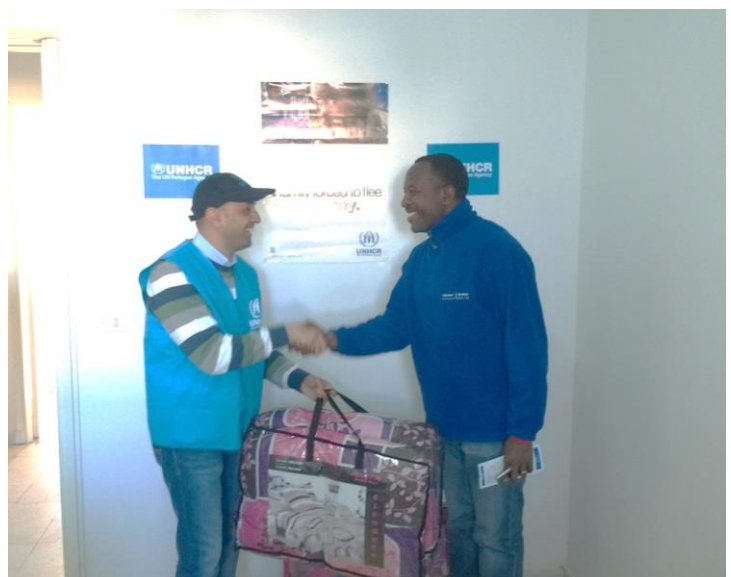
Distribution of non-food items during the winter season