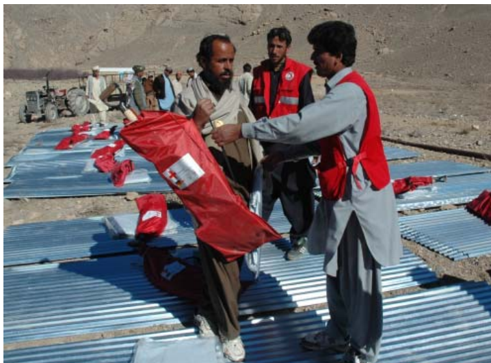
Beneficiaries receiving emergency shelter items in Zindra union council in Ziarat.

Progress: Under the Baluchistan emergency appeal, the PRCS/International Federation completed the allocation of 3,588 (Categories A and B) shelter kits on 4 January 2009. In late December 2008, the emergency shelter cluster allocated an additional 833 families in Ziarat to the PRCS/ International Federation, which were previously to be covered by the ICRC. Shelter items were also distributed to these families until 4 January. For the remaining shelter items, the PRCS/International Federation team in Baluchistan is carrying supplementary assessments to identify gaps and distributing shelter items to the families. Targeted people for the supplementary distributions are widows, elderly without close family support, households headed by adolescents, indigents and the disabled. The second round of distributions brings the total number of families assisted to 3,735.