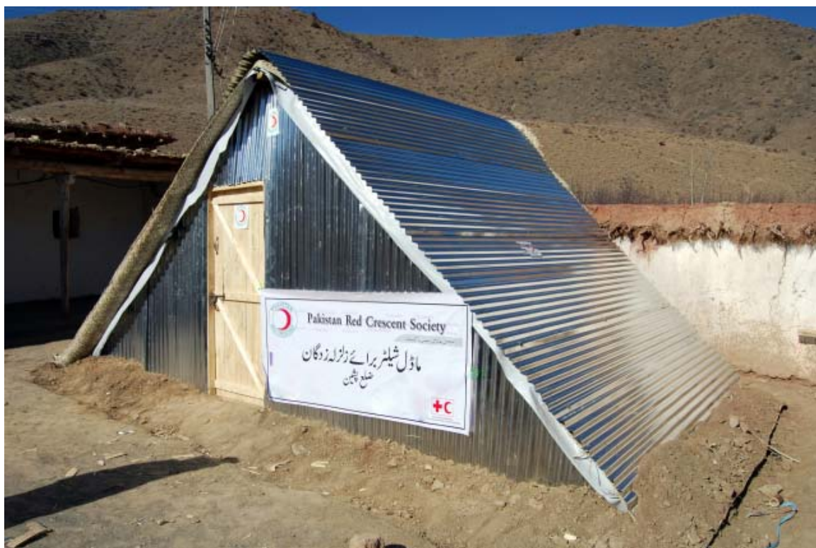
A Pakistan Red Crescent Society/International Federation constructed model emergency winter shelter.

Appeal coverage: 83%; including soft pledges and contributions in the pipeline. <click here to go directly to the updated donor response report, or here to link to contact details >