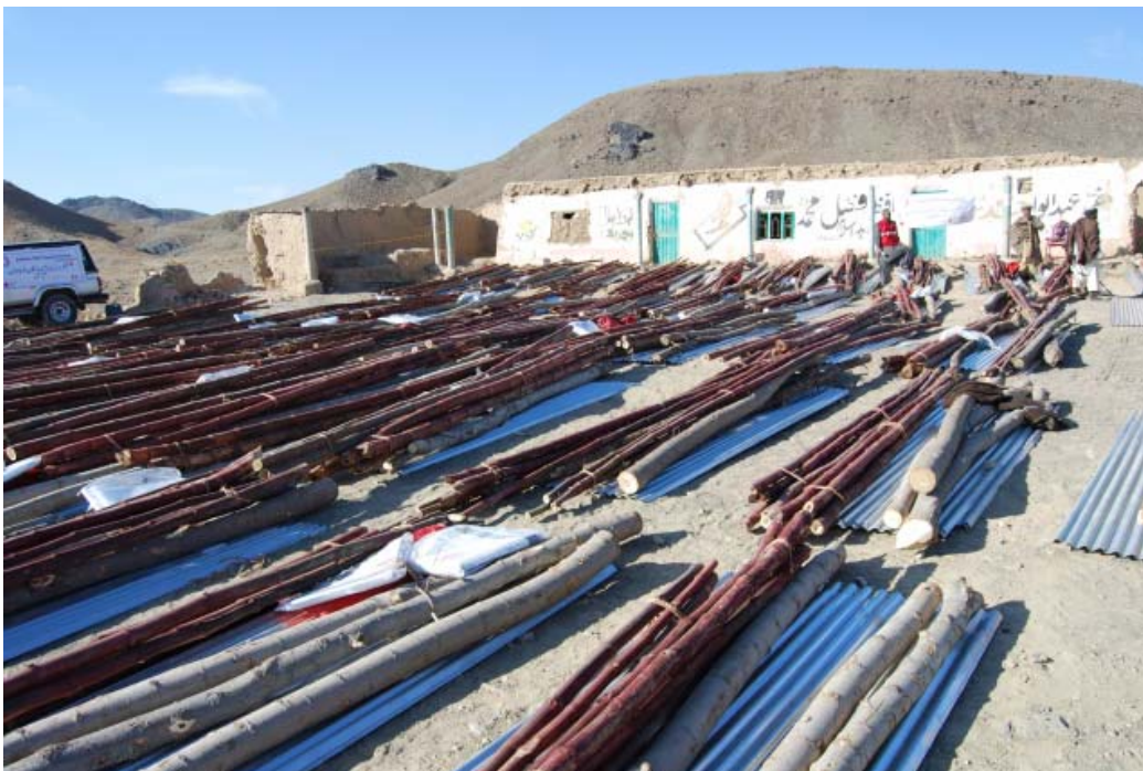
Emergency shelter items laid-out before start of a distribution in Pashin district. Each family received 12 CGI sheets, two tarpaulins, one shelter repair kit, 10 bamboos and three timber planks.

Challenges: One of the biggest challenges faced by the PRCS/International Federation teams in Baluchistan was the harsh weather. The other challenge faced by the teams was timely delivery of the supplies. These two challenges delayed the distribution of the shelter items among the affected families by five days.