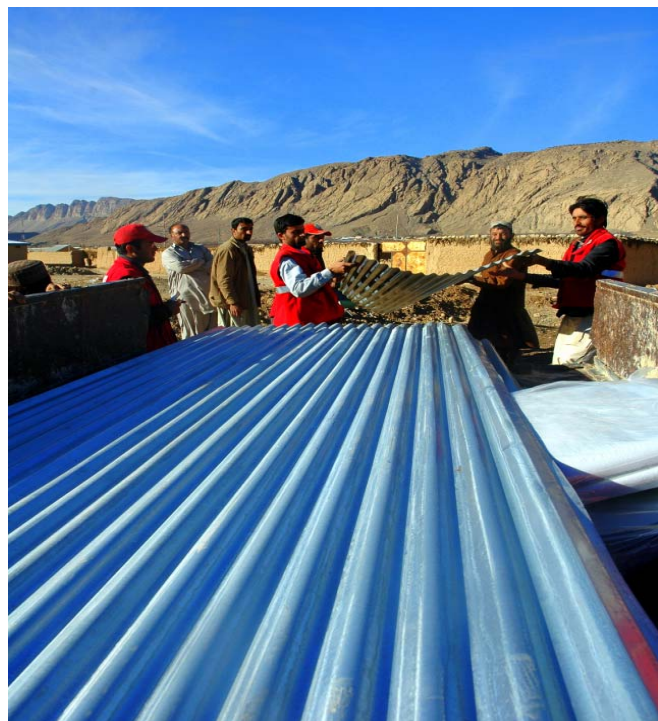
Beneficiaries loading corrugated galvanized iron (CGI) sheets on a trolley at Pitao village in Ziarat. More than 3,700 families have emergency winter shelter items from Pakistan Red Crescent Society and the International Federation.

The United Nations (through its various agencies) is carrying out a multi-sector relief effort in the