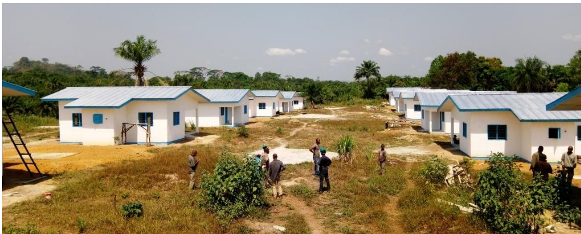
The 12 durable shelters in Bahn settlement are almost finalised.