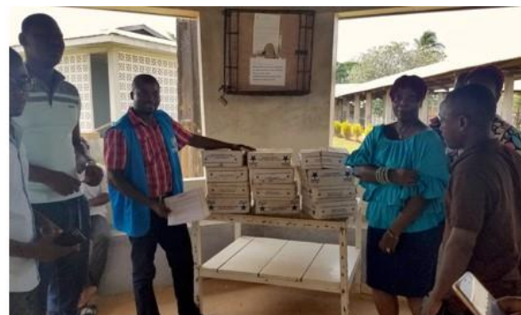
(L) UNHCR presenting 300 pieces of used zinc from decommissioned shelters of LWC. (R) JJ Dossen Hospital Administrator receives the donation for and un-behalf of the hospital.