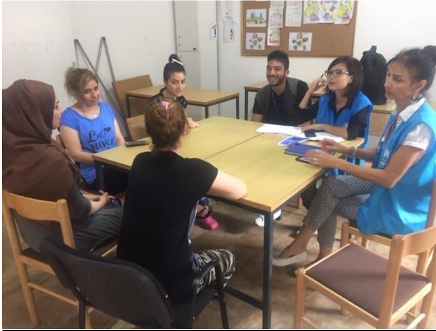
PSEA Focus Group Discussions in Sombor TC, @UNHCR, 2 August 2018