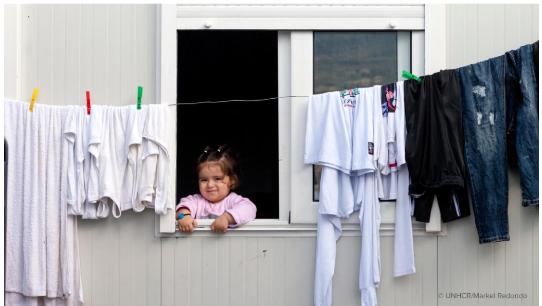
A refugee child in the Reception and Identification Centre of Vathy, Samos.

6 Island Offices in Lesbos, Chios, Samos, Leros, Kos, and Rhodes