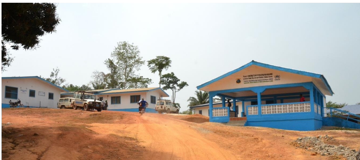
Bahn Health Center fully renovated, including the new Registration Building.