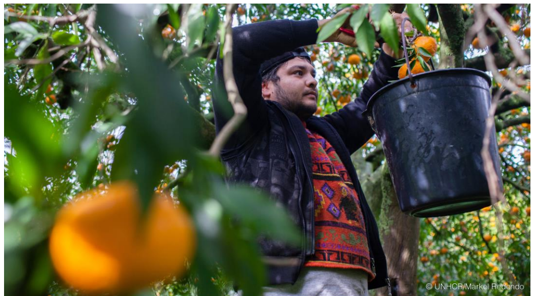
A young asylum-seeker from Afghanistan collects mandarins in a farm in Crete. While traveling to Europe he was separated from his wife and son. He now lives with his mother in Chania, thanks to UNHCR's accommodation programme which accommodates some 700 refugees on the island of Crete.