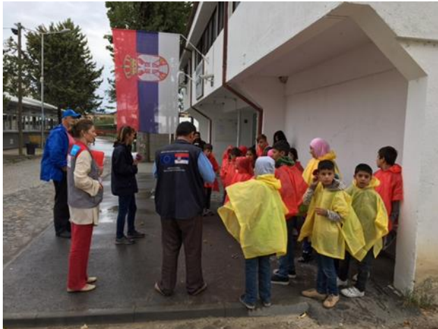
Refugee children from RC Presevo on their way to school, Presevo (Serbia), 21 September 2017