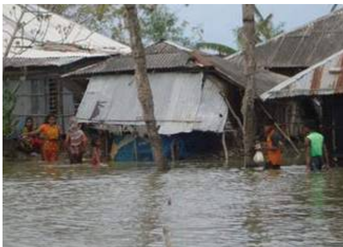
AILA affected area

Shayamnagar and Asasuni upazila were affected by wind driven surge which was 4-5 feet above normal astronomical tide. 9 unions of Shayamnagar and Asasuni were flooded adversely. Total 88 km of ring embankments damaged and 1 lakh people were affected in these 2 upazilas. 96 and 40 shelters were opened in Shayamnagar and Asasuni upazilas respectively. Dwellers of Kaliganj and Debhata upazila were also water logged. Army, Navy, Coast Guard and volunteers of different Government and non-government organizations have been involved in rescuing, relief and rehabilitation.