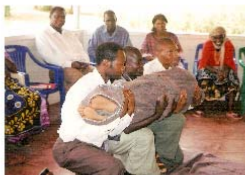
Red Cross volunteers during community-based First Aid training.

A total of CHF 93,000 was allocated from the Federation's Disaster Relief Emergency Fund (DREF) for the recovery assessment and immediate response.