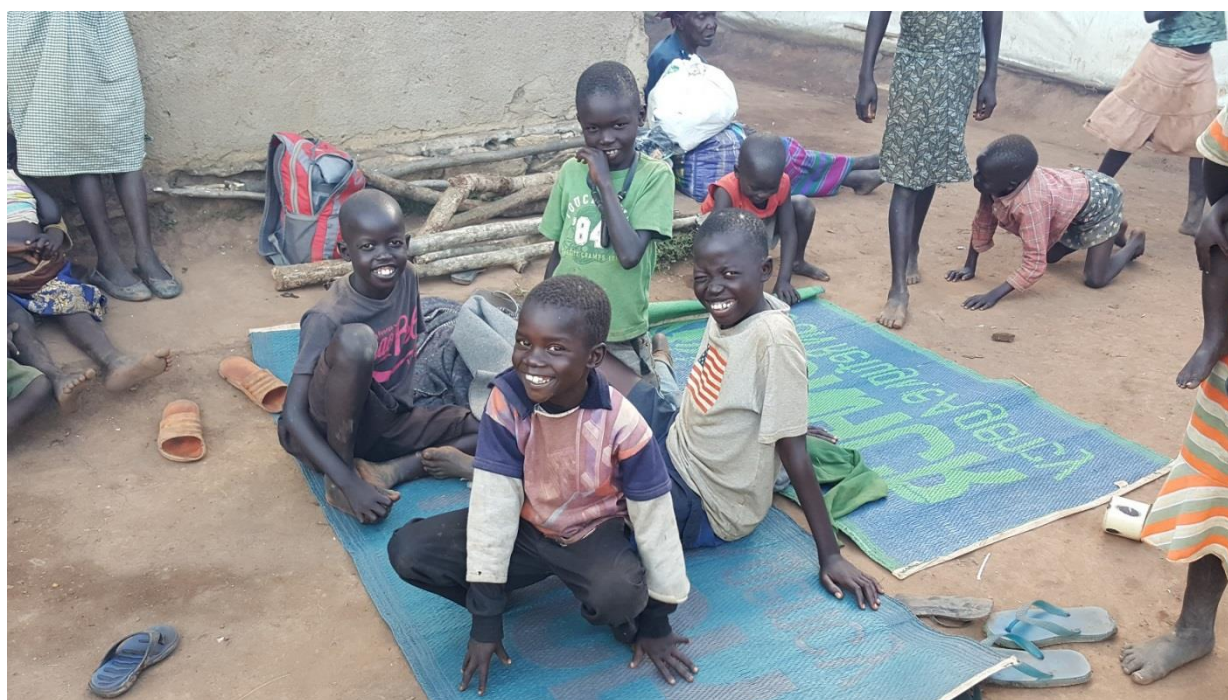
South Sudanese refugee children at Kuluba collection point wait to be transferred to Bidibidi settlement in Yumbe.