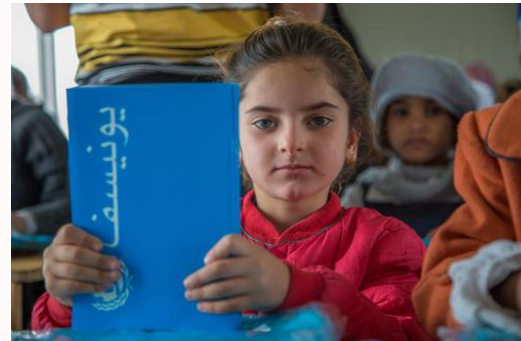
A school child shows a book provided to her during UNICEF's Back-to-School Campaign.