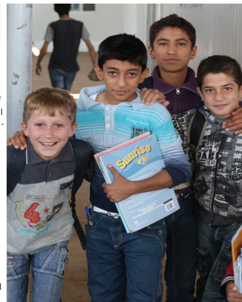
Domiz Refugee Camp, Duhok KR-Iraq

UNHCR is conducting an assessment on the context and feasibility to setup a DAFI program in Iraq, which grants scholarships to refugees at universities, colleges and polytechnics in their host countries. Through DAFI, UNHCR provides, on a limited basis, scholarships for refugees at the tertiary level in universities and polytechnic institutions through the Albert Einstein German Academic Refugee Initiative Fund (DAFI).