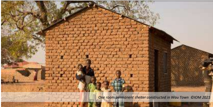
One room permanent shelter constructed in Wau Town