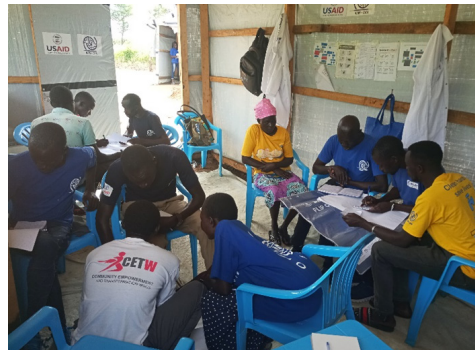
BH & PoE SOP Refresher Training for screeners at Birigo PoE

A total of 101 individuals presented with non-EVD fever, as follows: 19 at Khor Kaya; 17 at Birigo; 16 at Pure; 11 at Bazi; 10 at Bori; 8 each at Khorijo, and Salia Musala; 7 at Okaba; 3 at Kaya; and 1 each at Kaya, and Kerwa. Fifty-four (54) non-EVD fever cases recorded normal temperatures after subsequent measurements. All the other 47 cases were referred to the nearby health facilities for further management and treatment for malaria, respiratory tract infection (RTI), and diarrhea diseases. There were no suspected or alert cases reported during the reporting period.