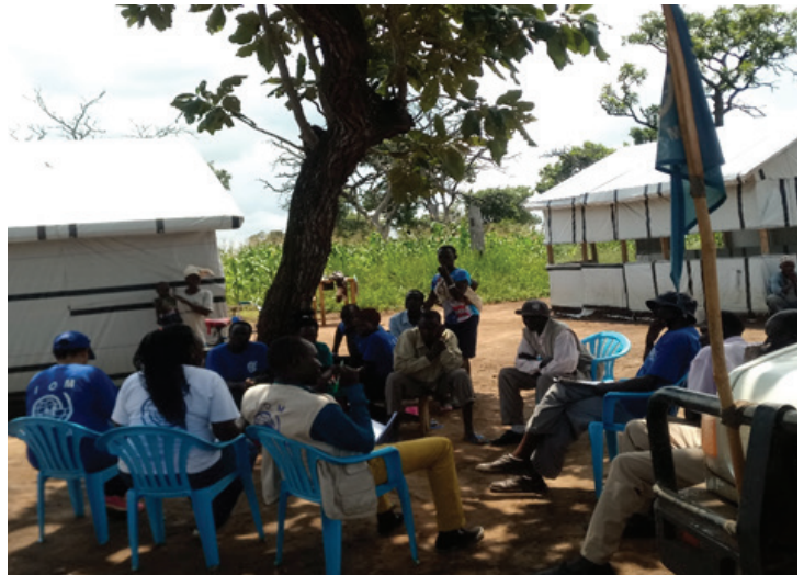
IOM team from Juba and Yei town doing monitoring visit to Bori PoE.

Per result of the assessment, the Geri health facility lacks enough qualified personnel despite having drugs kept at the county administrative block.