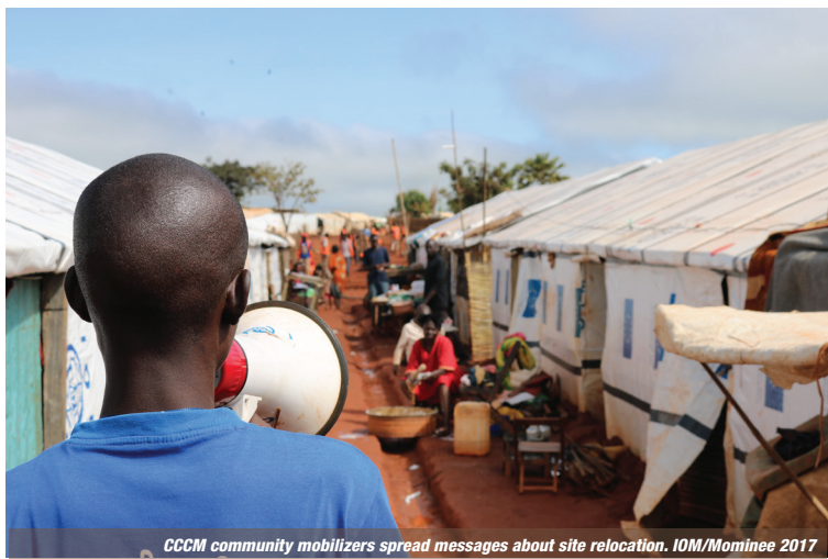
CCCM community mobilizers spread messages about site relocation.

NEW CCCM Online Training, CCCM Cluster invites all stakeholders to enroll at www.cccmlearning.org