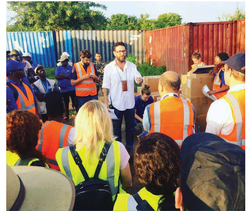
CCCM Program Manager briefs the UN House registration team.