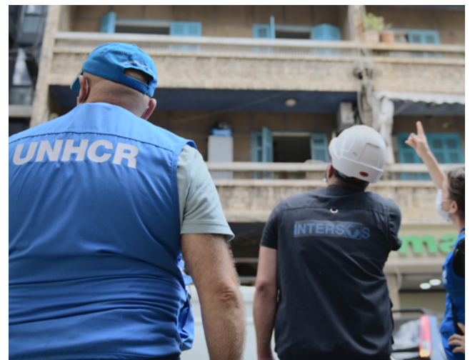
UNHCR and partners support Beirut residents affected by the blast.