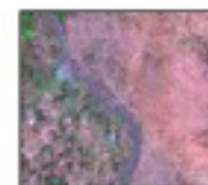
River delta, plain