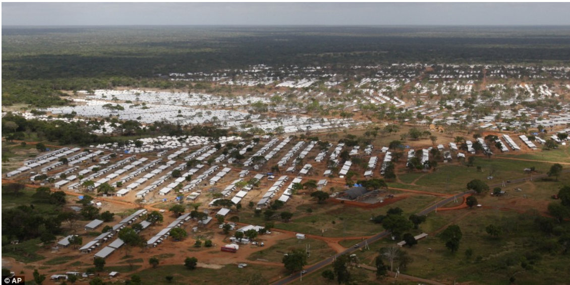
Aerial view of Menik Farm zones 1 and 2 where over 120,000 IDPs are accommodated. In total the Menik Farm sites accommodate over 225,000 IDPs

All humanitarian partners including donors and recipient agencies are encouraged to inform FTS of cash and in-kind contributions by sending an email to: fts@reliefweb.int