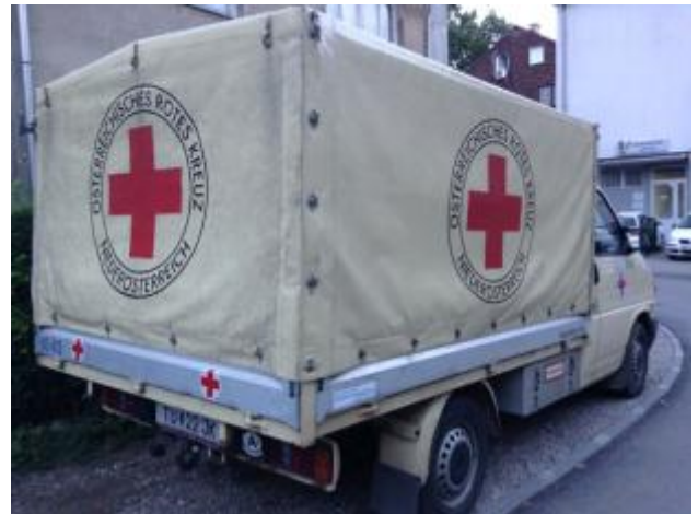
Bilateral WatSan support from the Austrian Red Cross arrived in Brcko District.

Swiss Red Cross and Austrian Red Cross have mobilized substantial support for RCSBiH to conduct a programme to support livelihoods recovery and the rehabilitation of houses by using cash transfer methodology.