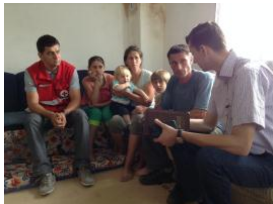
RSBiH volunteer and IFRC operations team in Brcko District visiting beneficiaries.

The target population to be assisted included areas which (except for the distribution of water as an immediate response) have not been covered. Households that are believed to be the most vulnerable in terms of access to water and sanitation provisions, and those who are severely impacted economically will be given priority. Geographic areas include primarily rural areas in the municipalities of Posavina/Domaljevac-Samac (Federation of BiH), Brcko (District of Brcko) and Bijeljina (Republika Srpska). In the following period the hygiene promotion campaign will be developed and shared with the authorities. With the gained knowledge the volunteers will train the affected population in Domaljevac-Samac, Brcko District and Bijeljina. Training on cleaning of wells at household level is planned for the first week of August. A date for the training is yet to be found, fitting for the trainer (an HCK expert), CP and RC branch. Austrian RC has deployed a WatSan Delegate for four months who is responsible for the overall WatSan programme.