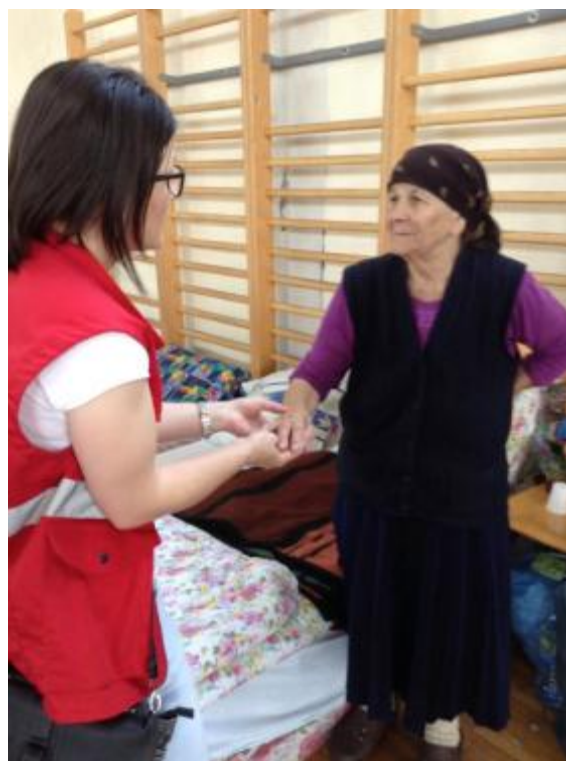
RCSBiH volunteer in Brcko District offers support to one of the collective centre's residents.