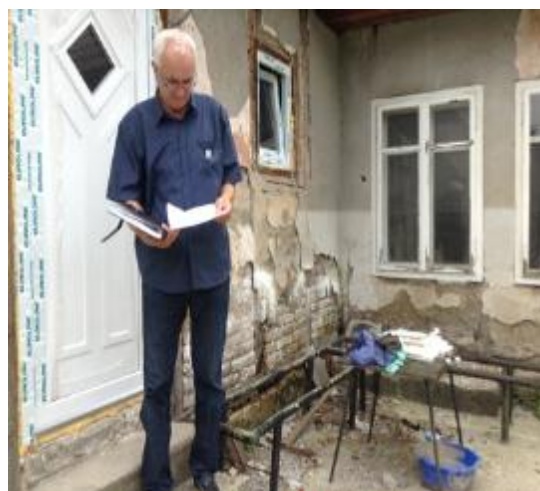
RSBiH Secretary in Maglaj on a site visit cross-checking and verifying the beneficiary lists for the planned Cash Transfer Program (CTP)

The IFRC aims to undertake a revision of the Emergency Appeal, which will include all bilateral contributions received by the RCSBiH from donors in order to present an overall picture of the support received by the BiH National Society at this point of time.