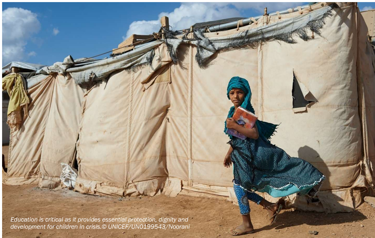
Education is critical as it provides essential protection, dignity and development for children in crisis.

The psychological impact of toxic stress and trauma on children living in conflict may have a profound effect on younger generations’ ability to rebuild peaceful societies. 30 Schooling may provide a safe space to socialize and restore a sense of normalcy after sudden shocks or extended periods of instability. Returning to a basic routine and schedule and making an investment in the future can also restore a sense of hope that things will improve. On an individual level, education has a demonstrated ability to counter the effects of psychosocial distress associated with conflict and natural disaster. 31 Education also provides opportunities to develop self-confidence and coping strategies that are reliant on skills ranging from basic literacy to self-control, conflict management, managing household resources, and planning for future events. 32