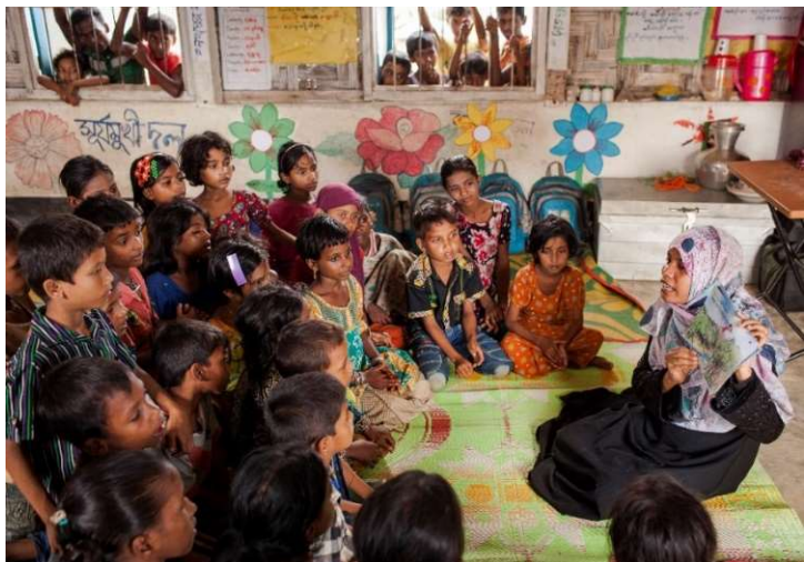
Ensuring that every child has the opportunity to receive a quality education is a pressing and urgent global concern.

Donor commitments have been equally substantial, injecting not only capital but also political momentum into the sector. The EU has increased financing to education in emergencies and crises from 1% of its humanitarian aid in 2015 to 8% in 2018 with an aim to reach 10% by 2019. 66 Norway has increased its share of humanitarian funding to education from 2% in 2013 to 9% in 2016. For 2017-2020, Switzerland has committed to increasing its funding allocation to education by 50% in its international cooperation compared to the previous four years.