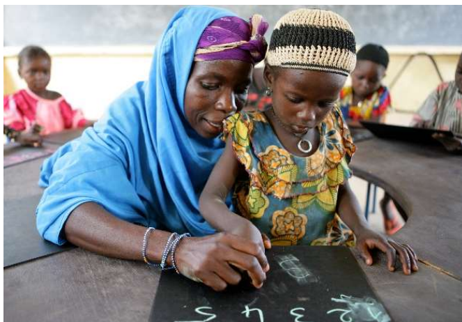
Education in emergencies continues to receive a lower than average share of the amount requested.

In the lead-up to the adoption of the Sustainable Development Goals (SDGs), the Government of Norway, together with the UN Special Envoy on Global Education, hosted the Oslo Summit for Education Development, including a specific Thematic Session focusing on Education in Emergencies . Among other commitments, this session called for increased long-term predictable financing to meet the education needs of children and youth affected by crisis, to protect children through education, and to keep education safe by stopping attacks on schools, education facilities and personnel.