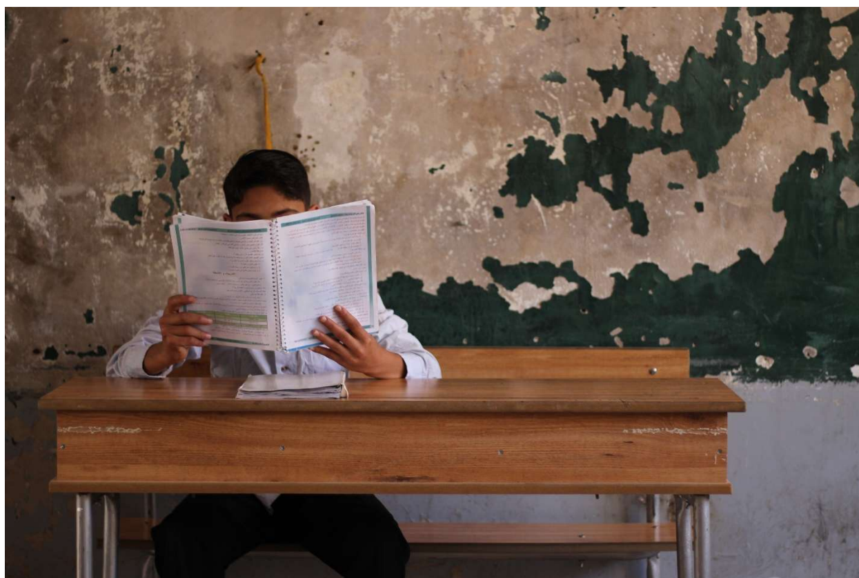
Violence against students, educators, and their institutions has become more widespread over the last five years.

While lauding the benefits of education as a protection measure, school facilities are not always safe places for children – in fact, they are often specifically targeted. 46 47 During armed conflict or instability, children can be abducted and recruited from school or on their way to or from school; schools can be used to spread hate or exclusion; and children, teachers, professors, education personnel can be physically targeted as part of a military or political tactic. 48 Furthermore, inequities in education provision have been found to further disadvantage and alienate marginalized groups, potentially fueling conflict. 49 According to the Global Coalition to Protect Education from Attack (GCPEA) 2018 Education under Attack report, violence against students, education personnel, and their institutions has become more widespread over the last five years, 50 occurring in more countries, and intensifying in some. 51