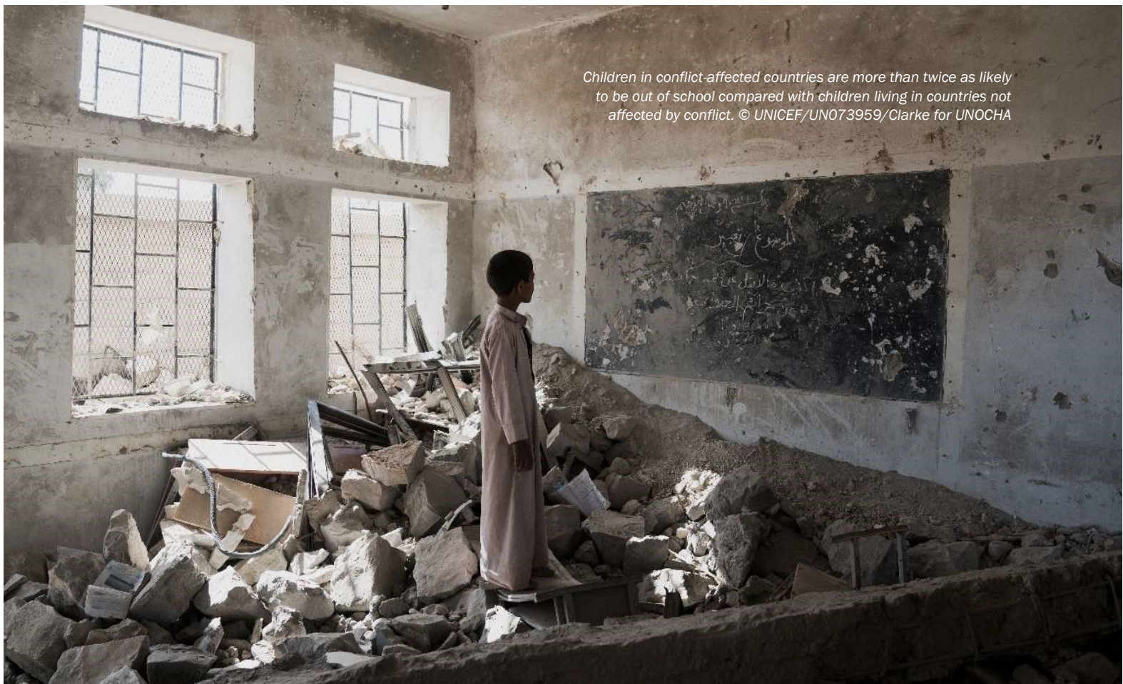
Children in conflict-affected countries are more than twice as likely to be out of school compared with children living in countries not affected by conflict.

Where education has been denied or undermined, it is not just a loss to the individual, but also a loss of social capital to society as a whole. 16 Lack of education can increase a population’s vulnerability by leading to lower economic and health outcomes, 17 higher rates of child marriage and early pregnancy, and an increased risk of children and youth being radicalized or recruited to armed actors. 18 Children and youth without an education miss opportunities to develop academic, social, emotional life skills and the critical thinking that allows them to secure better futures and help them cope in future crises. 19 Mitigating these shortfalls so that every child has the opportunity to receive a quality education is a pressing and urgent global concern.