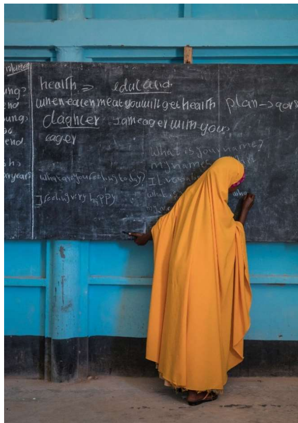
An estimated 37 million school-aged children in conflict-affected countries are without an education.

Humanitarian emergencies and protracted crises have impacted the education of more than 75 million children and youth across the globe. During conflict, access to education is limited not only because of general insecurity, but because students, teachers and educational facilities are attacked, and schools are used for military purposes. 1 These attacks are on the rise 2 with devastating consequences: children in conflict-affected countries are more than twice as likely to be out of school compared with those living in non-affected countries. 3 Today, an estimated 37 million school-aged children in conflict-affected countries are without an education. If they are in school, children in conflict are a third less likely to complete primary school, and 50% less likely to complete lower secondary education. 4