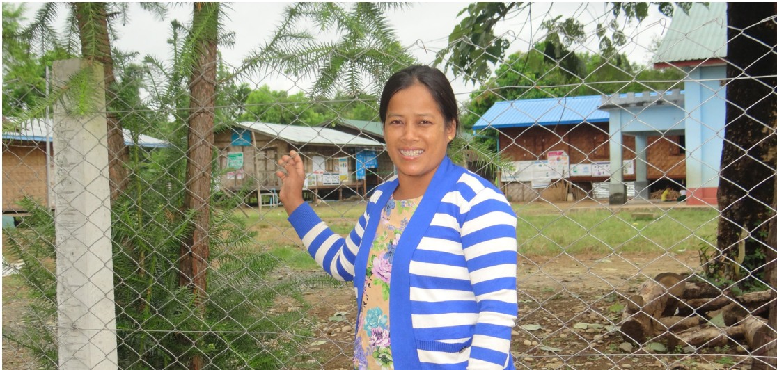
Myitkyina, Myanmar. A displaced woman stands against a newly renovated fence in her camp in Myitkyina, Kachin. Humanitarian responders have rehabilitated the old chain-link fences to promote security and dignity for the displaced population in the camps for displaced people in Kachin, a project with funding from the Myanmar Humanitarian Fund.