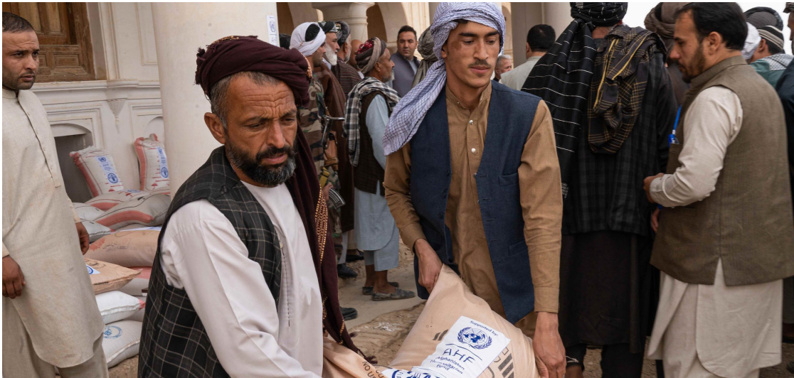
Mazari Sharif. People receive food assistance, supported by the Afghanistan Humanitarian Fund.