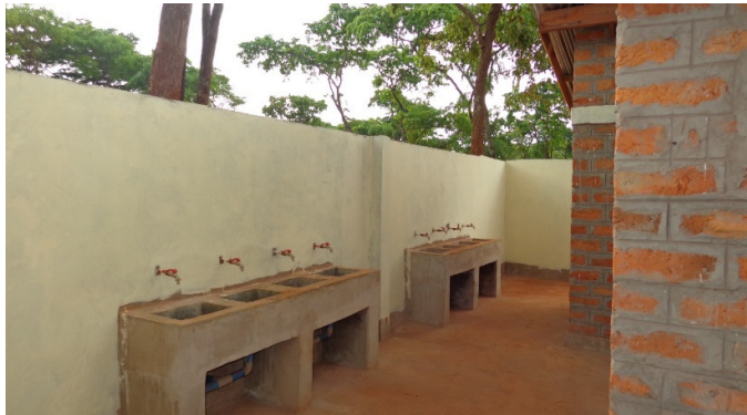
New handwashing station and latrines have replaced makeshift latrines in refugee schools.