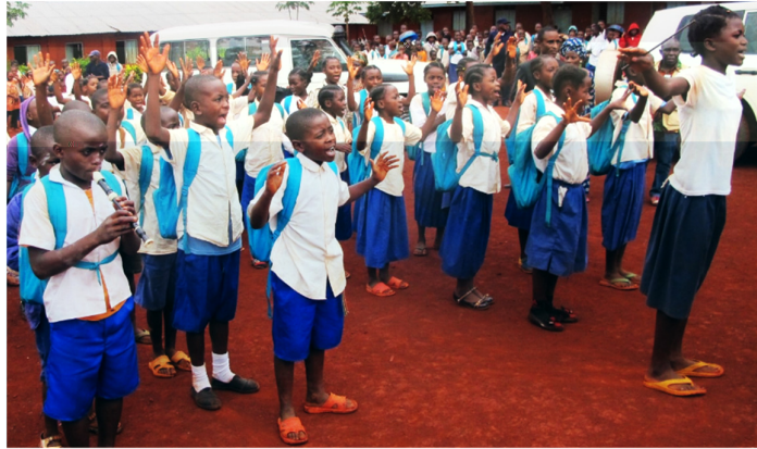
Refugee children with UNICEF schoolbags sing during visit by a delegation of Nordic donors.

UNICEF and UNHCR continued national level engagement with the Tanzania Ministry of Education and Vocational Training regarding oversight of final examinations for 1,500 Burundian refugee children in grade 9 and 10. The National Examinations Council for Tanzania (NECTA) has confirmed their willingness to administer the examination in early February, 2017. UNICEF has, in collaboration with NECTA, started field level preparations for examinations, including intensive classes and support to teachers as well as planning of logistics. The education program is experiencing a shortage of reference materials, especially for the first grade in secondary education following to the change of the Burundian curriculum. To address this problem, teachers received orientations and materials to facilitate the re-structuring of lesson plans. Consolidated school supply needs from all three camps have been prepared for subsequent UNICEF supply planning.