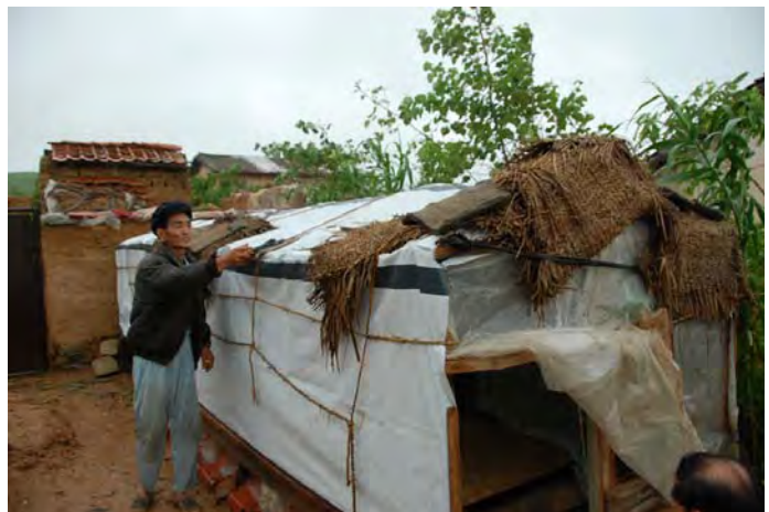
Families received family tents and other non-food items including hygiene kits and water purification tablets in Honam-ri, Yonan county.

<click here to view the attached Emergency Appeal Budget; here to link to a map of the affected areas; or here to view contact details>