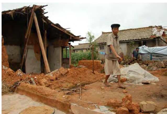
People trying to rescue still usable materials, after heavy rains severely damaged their houses in Chontae-ri, Yonan county, south Hwanghae province

Dilapidated buildings made of mud and poor quality cement collapsed under the weight of too much rain and hard winds. While some communities were hardly affected, neighbouring communities reported damage on approximately 90 per cent of all buildings, and others with up to 50 per cent of all dwellings totally destroyed.