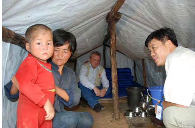
They key needs identified are food, proper shelter and safe drinking water.

For the food distribution component, a total of 6,000 of the most vulnerable families (approximately 24,000 people) will be selected among the total 11,238 affected households. For the water and sanitation and shelter/permanent housing component of the appeal, 1,000 of the most vulnerable families (approximately 4,000 people) will be selected, to receive new houses and latrines. Five of the most vulnerable communities will be selected for the construction and/or repair of the water supply scheme.