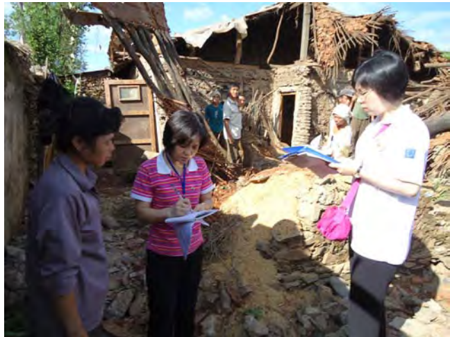
DPRK Red Cross headquarters staff interviewing flood victims during an assessment visit to Pongchang-ri, Kaesong city.

Two inter-agency emergency health kits were prepositioned to south Hwanghae province. The release of the kits, which provides basic medicines for 10,000 people for three months, will be decided jointly with the ministry of public health based on the needs.