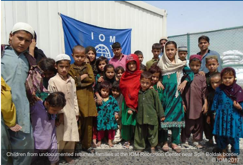
Children from undocumented returnee families at the IOM Reception Center near Spin Boldak border.