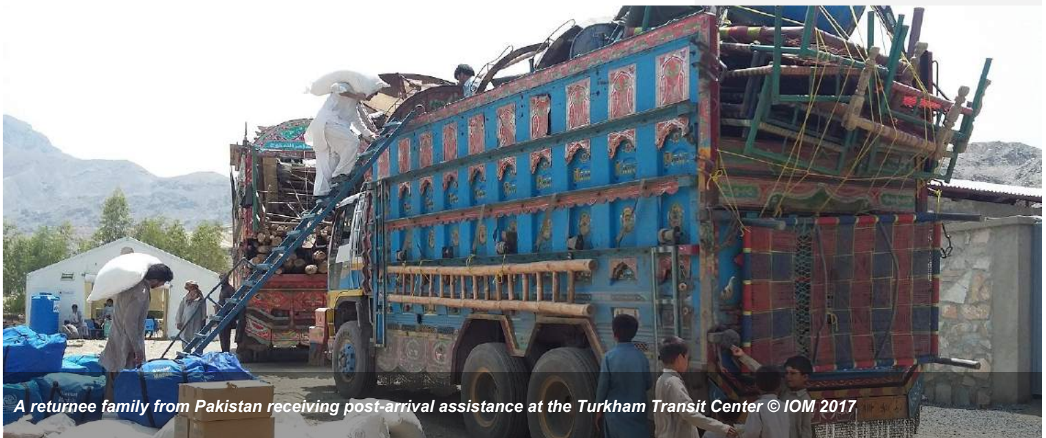
A returnee family from Pakistan receiving post-arrival assistance at the Turkham Transit Center

6% of returnees from Iran (524 individuals) assisted