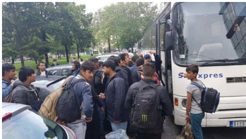
Relocations from Belgrade city to government shelters, Belgrade (Serbia) UNHCR 07 May 2017

55% of the residents of Presevo RC are from Afghanistan, 29% from Iraq, 8% from Pakistan and 6% from Syria. 48% are children. In Bujanovac, which continues to accommodate only families with children and UASCs, 32% are from Iraq, 30% Afghanistan, 23% from Syria and 14% from Iran. 58% are children.