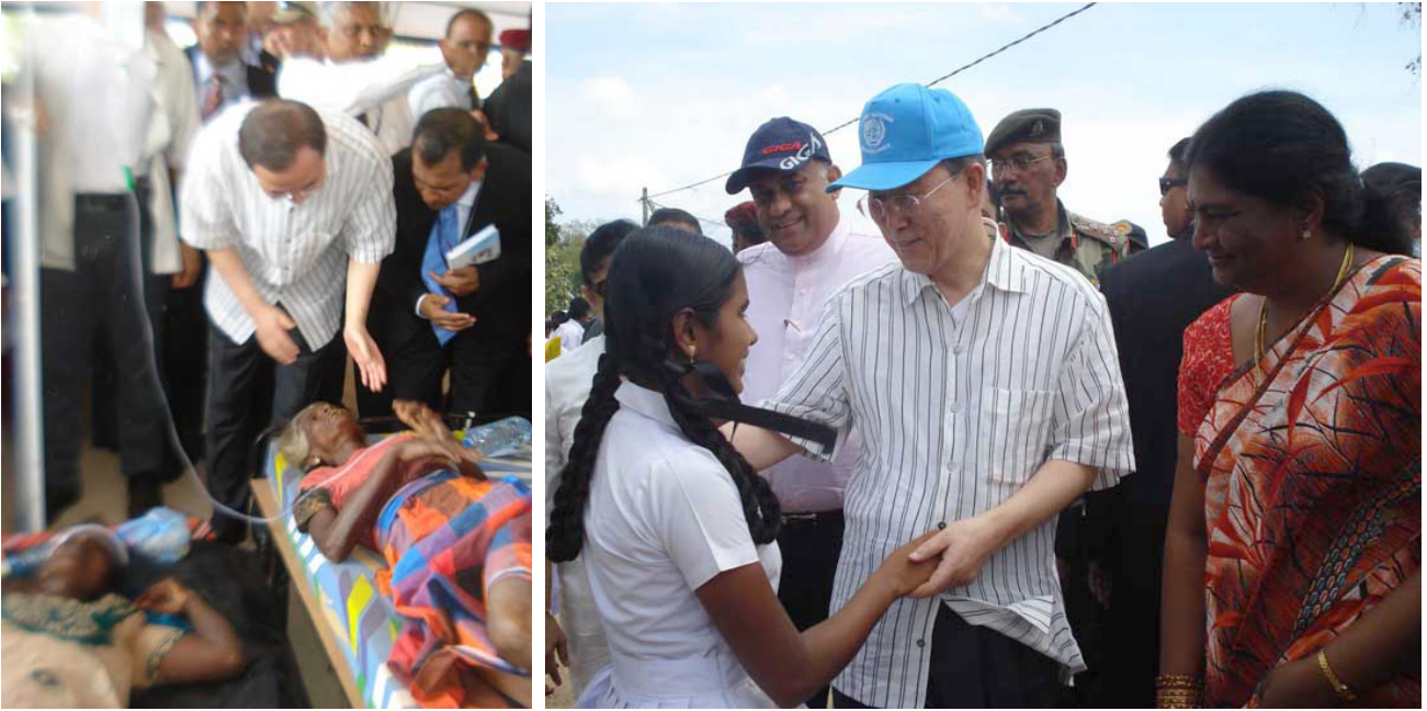
UN Secretary General Mr. Ban Ki-moon visited IDP sites in Vavuniya on 23 May 2009

All humanitarian partners including donors and recipient agencies are encouraged to inform FTS of cash and in-kind contributions by sending an email to: fts@reliefweb.int